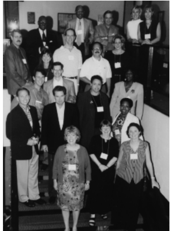
Class of 1986