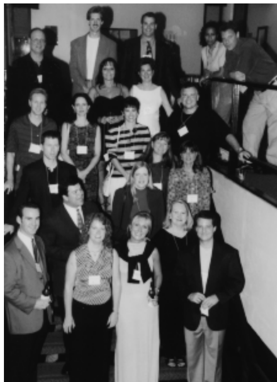
Class of 1991