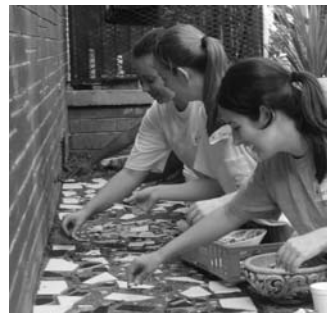
Students assemble the back-porch mosaic.

What better time to show our dedication to the community than in the midst of our 25th anniversary and our 25,000 pro bono hour pledge?