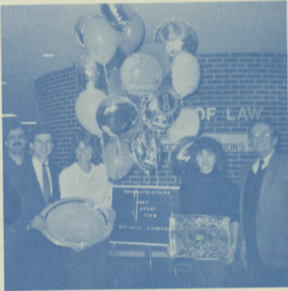
The GSU Moot Court Team brought home the silver by winning the National Championship in New York City. They returned to Atlanta to balloons and cheers from students, faculty, and staff.