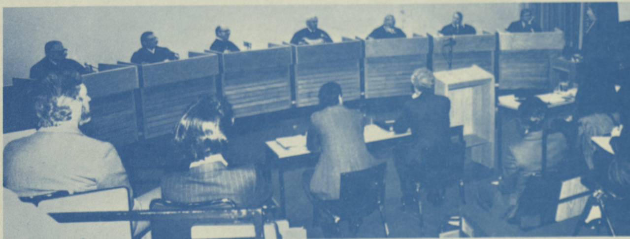
The Georgia Supreme Court held a special session at the College of Law in February 1988. It was the Court's first

NATIONAL LAWYERS GUILD. Last fall, the National Lawyers Guild Chapter of GSU trained students and faculty to serve as representatives of the Cuban Detainees incarcerated at the Atlanta Penitentiary. Three students were serving as representatives in hearings when the riots in October 1987 erupted. Together with Guild Sponsors Groups at Emory and Georgia, GSU law students, staff and faculty provided representation for each of the 150 Cuban detainees transferred to Ft. Gordon for hearings held during February and March. Guild representatives will participate in INS Hearings this spring for detainees incarcerated in Talladega. Anyone interested in assisting with representation should contact a Guild member or the Office of The National Lawyers Skills, Rm. 173.