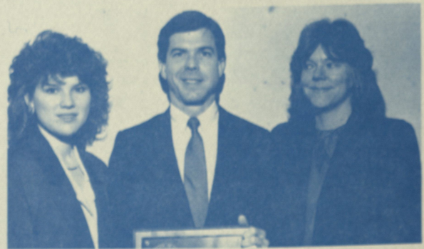
The GSU National Moot Court Championship Team received a special award from the College of Law Alumni Club at the Annual Alumni Breakfast, February 29, 1988.