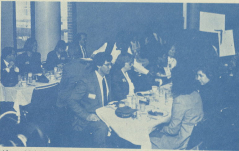
Alumni join law school faculty and staff in the Urban Life Center for their Annual Alumni Breakfast, February 29th.