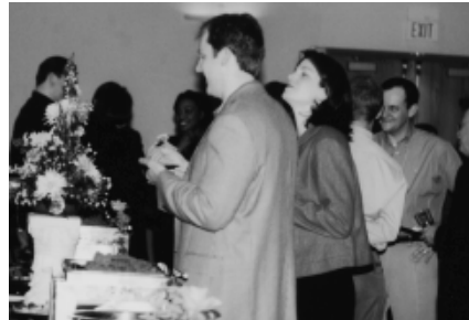
Graduates from classes of 1985, 1990 and 1995 reconnected with classmates at their reunion held at the Georgia State University Student Center Ballroom on Saturday, March 31, 2001.