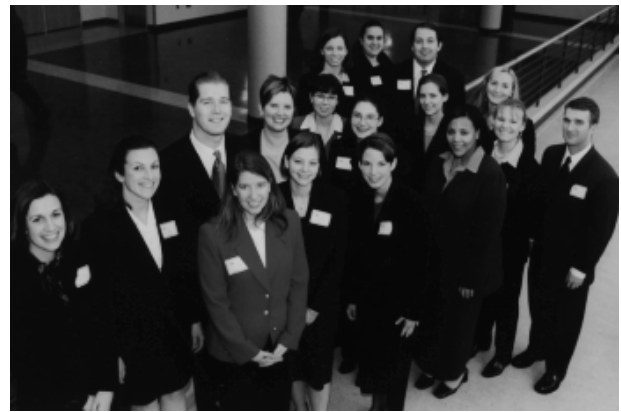
Law Review staff