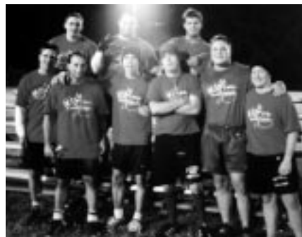
Members of the "Wily Quadrupeds," a GSU intramural football team of all law students