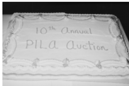
Celebrating 10 years of success.